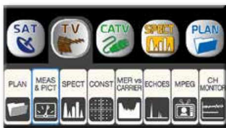
New Icon Navigation Menu