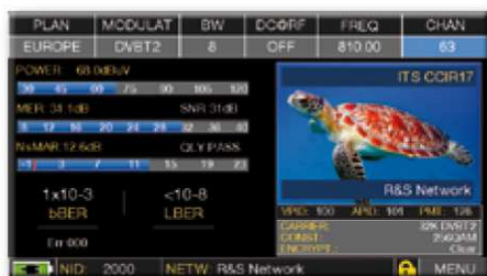
New Meas. & Pict. Super fast