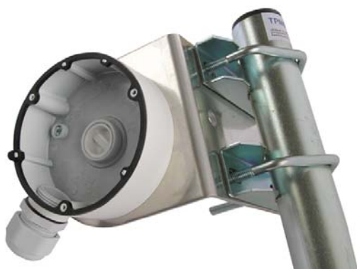
HIK120L + 2x Z85DV85 + DS-1280ZJ-DM18