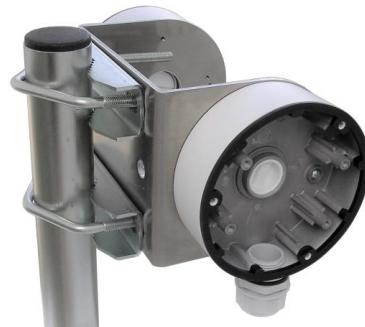
HIK134L + 2x Z85DV85 TWIN + 2x DS-1280ZJ-DM46