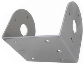
sheet HIK134L TWIN