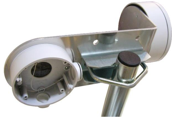
HIK134L + Z5V105 TWIN-C + 2x DS-1260ZJ