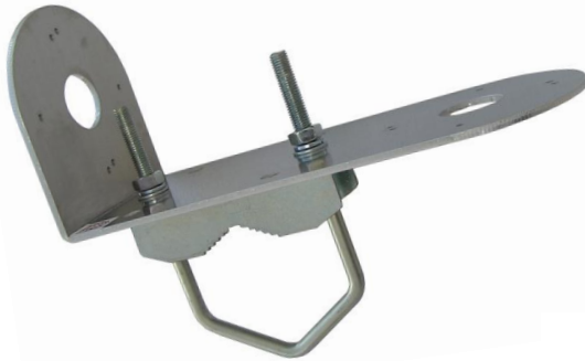
HIK134L + Z5V105 TWIN-C