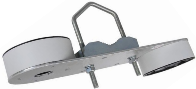
HIK134 + Z5V105 TWIN + 2x DS-1280ZJ-DM46