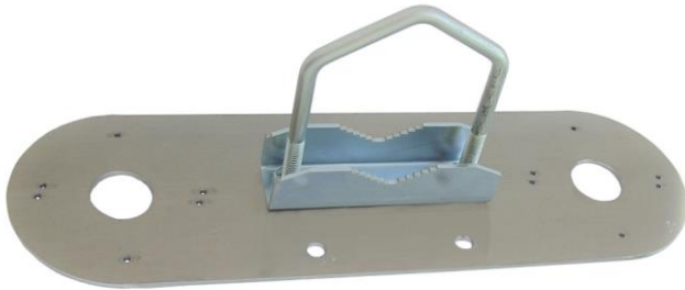
HIK134 + Z5V105 TWIN